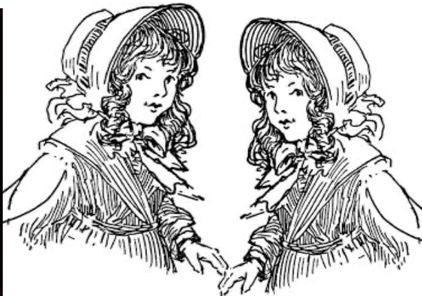
The orphaned sisters